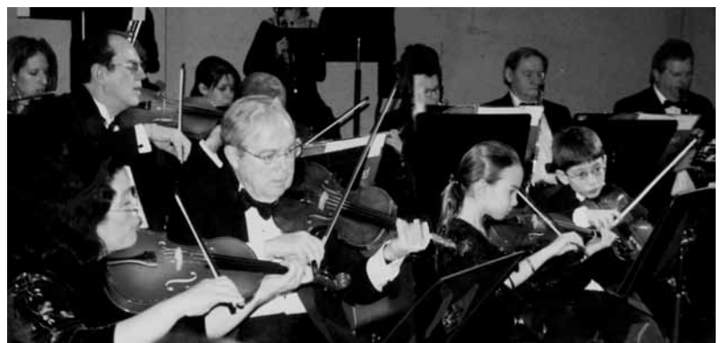
NJIO 2005 Winter Concert

Only NJIO offers musicians of all ages the opportunity to play music in a unique intergenerational environment. Students, adults, and senior citizens, with the guidance and assistance of music professionals, come together to produce enjoyable programs for the community.